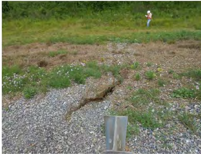
Photo 36 – Typical erosion rills observed at the top of the east and south embankments, where the crest was recently raised. This erosion rill is approximately located at STA. 18+40 on the east embankment.

Response: Minor erosion rills were repaired along the downstream edge of the crest in March 2016.