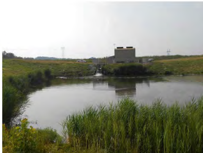
Photo 30 – Median dike, metering station, and discharge structure to the polishing pond, looking north.