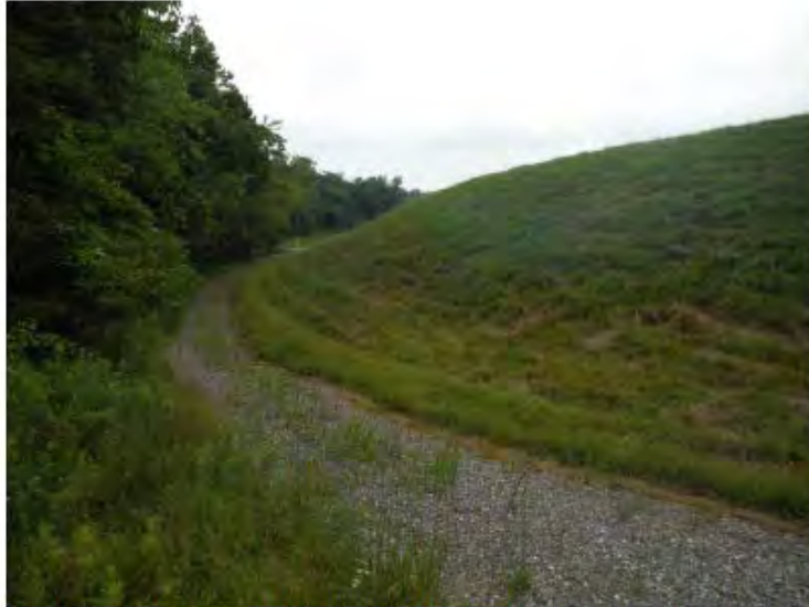
Photo 20 – Toe of the west embankment where significant disturbance was observed in 2011. The area has been regraded and reseeded. Wet soils and rutting were observed previously. A new gravel access road was installed along the toe in 2015.

Response: During the week of August 15, 2016 and August 22, 2016 the vegetation within the ditch along the toe of the North West embankment has been cut to less than 6" high. This work was completed by Liberty Excavators Inc. LLC under contact 645355. Photos of the completed vegetation clearing: