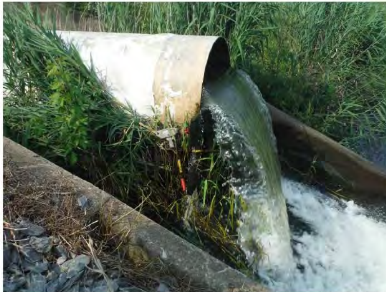
Photo 39 – Discharge pipe through the median dike observed to be 2/3 blocked with a timber exit weir. The spillway adequacy analysis assumed this discharge structure to be at full capacity. Maintenance staff were aware that the weir needs to be removed during a flood.

Response: Brunner Island LLC has removed the weir following the static mixer/pipeline cleaning in December 2015. The weir may need to be temporarily installed during periods of extreme low flow