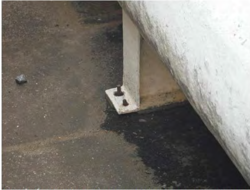
Photo 38 – Missing nuts observed on most of the bolts on the saddles of the discharge pipeline to the polishing pond.

Response: On June 7, 2016 Brunner Island LLC employees tapped, chased studs, and installed new hardware.