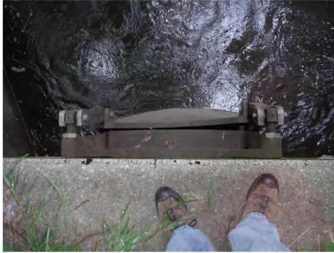
Photo 35 – Flapper valve at the end of the polishing pond discharge line.

Response: On June 7, 2016 Brunner Island LLC employees rigged the flapper gate to a crane end exercised the gate through its full range of motion. The flapper gate was greased, the bottom of the pipe was cleaned, and completed the inspection.